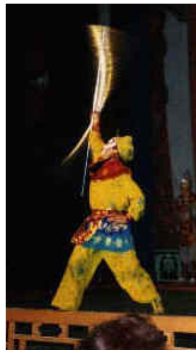
Monkey King spins his silver staff

In search of a weapon that was befitting of his character, he went to the Palace of the Dragon King under the Eastern Ocean. The Dragon King welcomed him and agreed to show Monkey weapons from his vast treasury. One by one Monkey tried out the weapons, but felt that none were quite right for him. One weapon, with which the Dragon King did not really want to part, was then brought before Monkey. This was an iron rod that was used to pound flat the Milky Way and it was