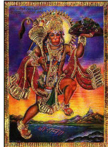
The Monkey God Hanuman

The monkey is also one of the 12 astrological animals of the Chinese zodiac.