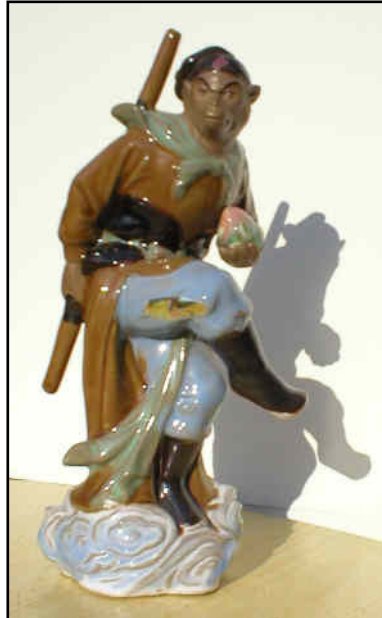
Monkey with his magic staff and one of the 'celestial peaches of immortality'

A parallel is often drawn between sword skills and calligraphy / artwork. In contrast, the sabre is associated with more physical manual work.