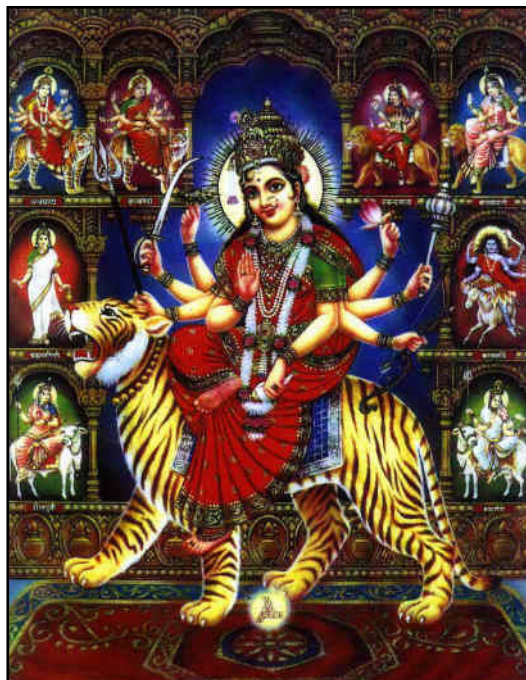
The Goddess Durga riding a tiger

It is associated with both Shiva and Durga. Shiva (The Destroyer) is often depicted wearing a tiger skin, whilst Durga in her destructive aspect rides a tiger.