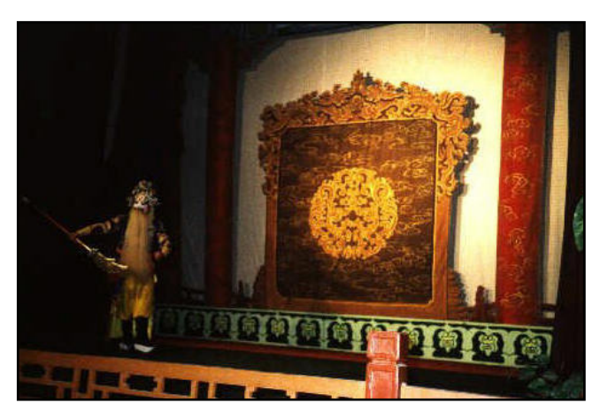
The Dragon King in performance